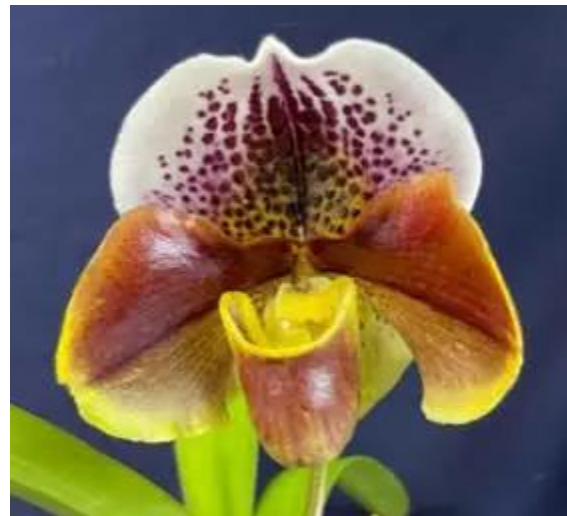
Paph. Cathedral Cove - Pam LaRocco

Visit us at our website www.kyorchidsociety.com or on Facebook at Kentucky Orchid Society